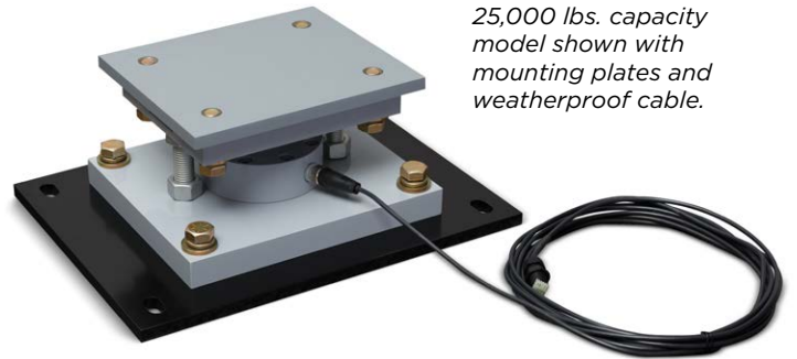
25,000 lbs. capacity model shown with mounting plates and weatherproof cable.